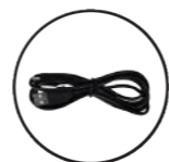
USB data cable