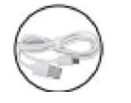
USB cable (GT8911)