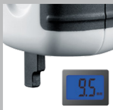
Tread depth measurement with digital display