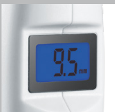
Illuminated LC display