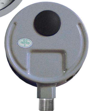
Epoxy Painted Cases also available