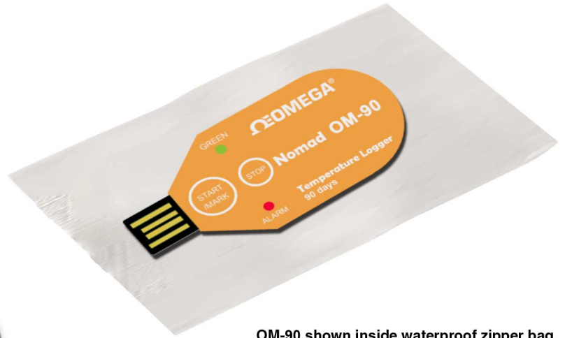
OM-90 shown inside waterproof zipper bag.