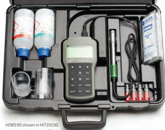
HI98190 shown in HI720190 rugged carrying case with custom thermoformed insert (included)