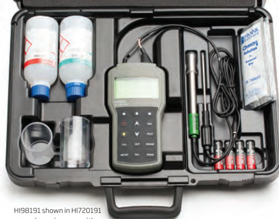
HI98191 shown in HI720191 rugged carrying case with custom thermoformed insert (included)