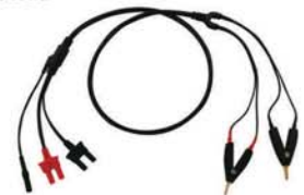
GTL-308 Test lead