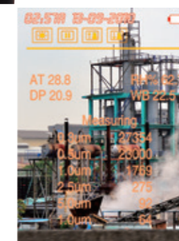
Fold reading on the images