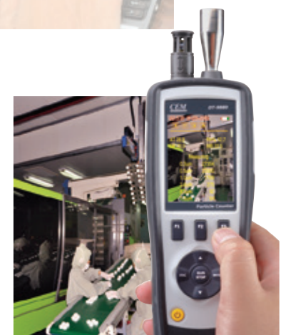
JPG images/AVI videos