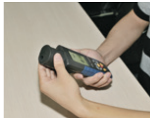
The top of 9501 can be rotated and easily used for \alpha , \beta , \gamma and X rays selection