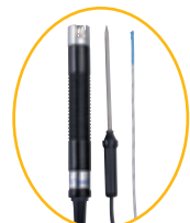
Temperature probe ( Optional: NR-31B / TP-500 / TCP-100 )