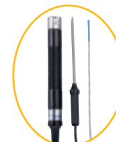
Temperature probe ( Optional:NR-31B / TP-500 / TCP-100 )

Size(HxWxD): 180mm x 106mm x 48mm Weight: 250g