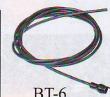
BT-6 Φ6mm Camera Probe