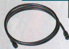
YC-17 Φ17mm Extension Cable (1-3 meter optional)