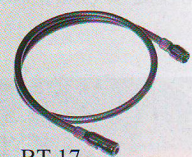
BT-17 Φ17mm Camera Probe