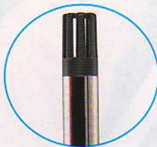
High Performance and quality sensor