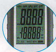
Large, easy-to-read LCD display with backlit