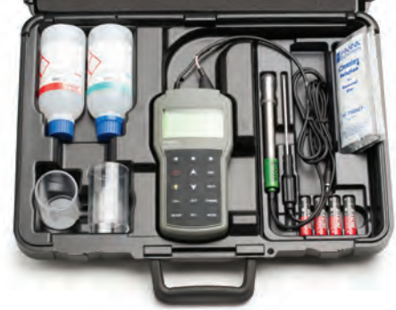
Shown in HI720192 rugged carrying case with custom thermoformed insert (included)